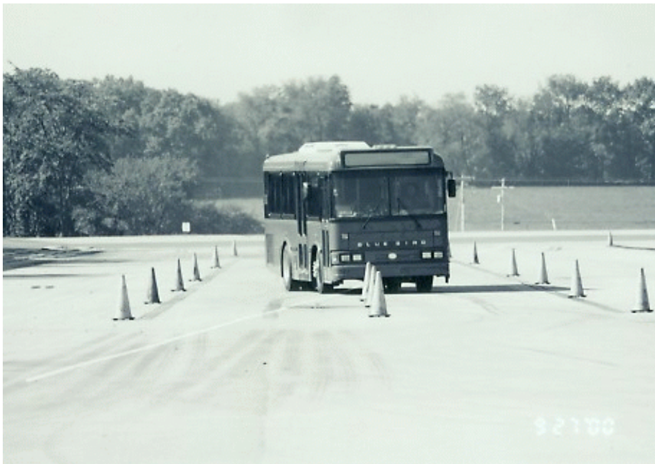
LEFT - HAND APPROACH