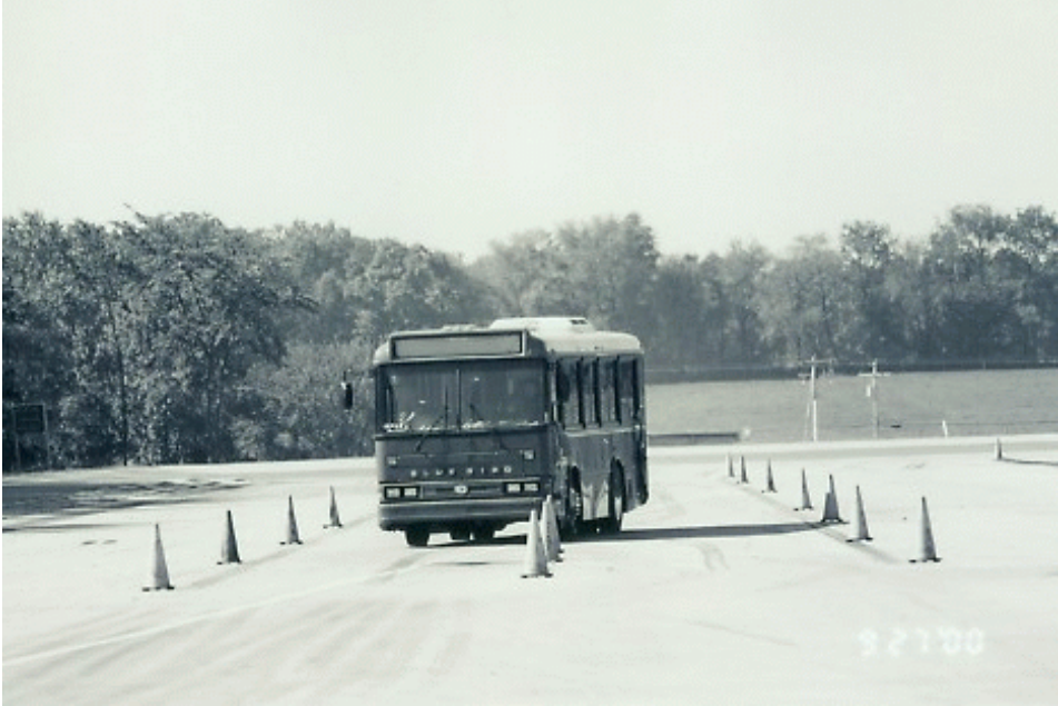
RIGHT - HAND APPROACH