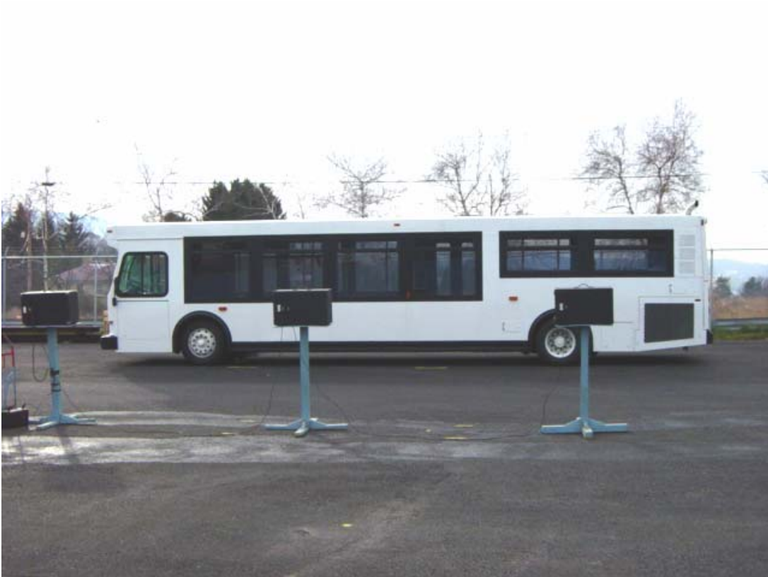
TEST BUS SET-UP FOR 80 dB(A) INTERIOR NOISE TEST