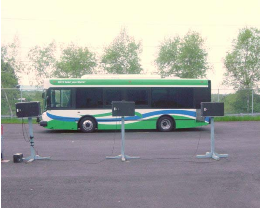
TEST BUS SET-UP FOR 80 dB(A) INTERIOR NOISE TEST